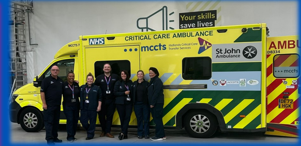
"Sims in the ambulance, critical for skill development"

ACCOTS Adult Critical Care Co-ordination & Transfer Service